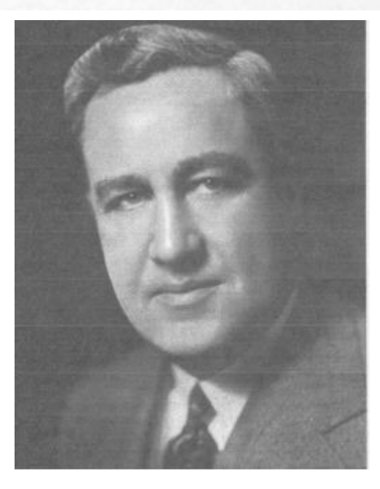
HENRY A. PAGE STADIUM